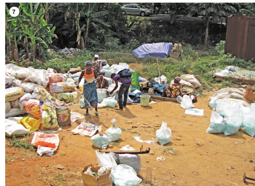
Fig 7 Sorting recyclable glass at Koforidua's bead market (note the car spring)