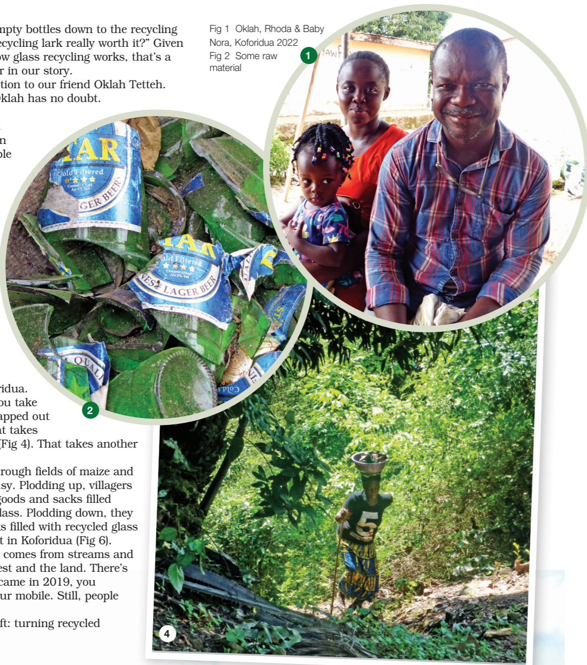
Fig 3 Landscape around Oklah's bead village, Tsebi Teryi Fig 4 Uphill all the way – Oklah's village is only reachable on foot!