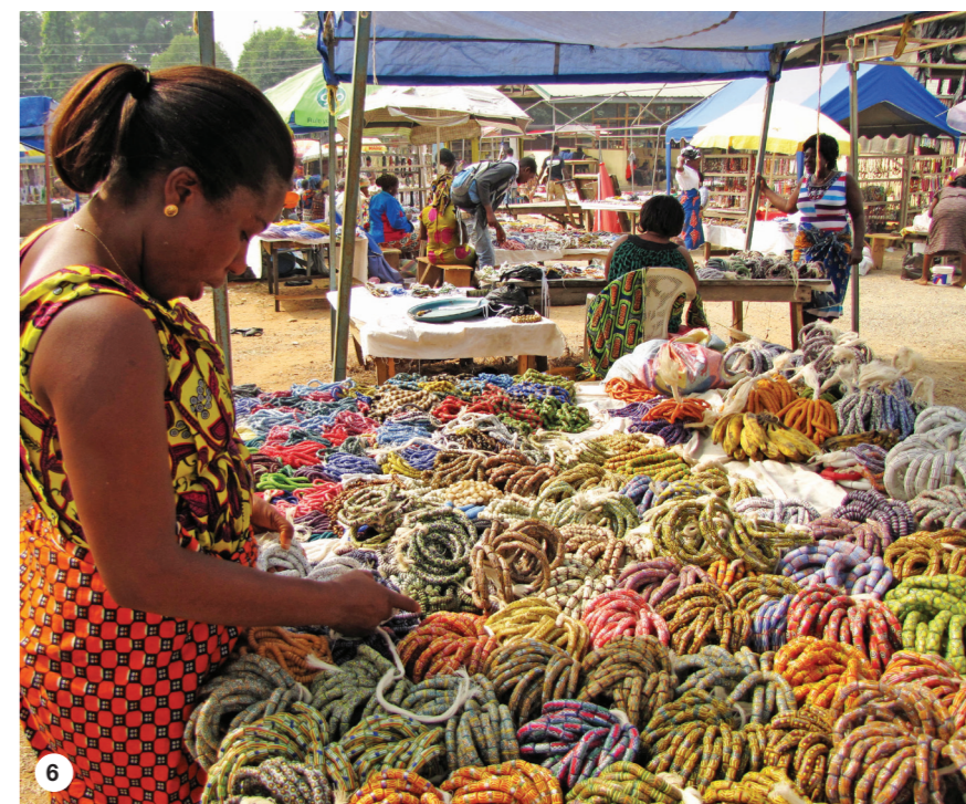
Fig 5 Oklah's workshop in the bead village of Tsebi Teryi